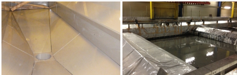
Top: Technical drawing of a CDC dipping plant; bottom left: CDC tank with SIMONA® PP AlphaPlus® liner; bottom right: CDC tank filled with liquid paint

G&H Kunststofftechnik GmbH & Co. KG specialises in the lining of CDC tanks for cathodic dip coating (CDC) of body panels. For the first time in the commercial vehicle sector, an existing steel CDC dipping plant was to be lined with plastic for Claas Selbstfahrende Erntemaschinen GmbH. G&H chose SIMONA® PP AlphaPlus® as a proven lining material for this purpose.