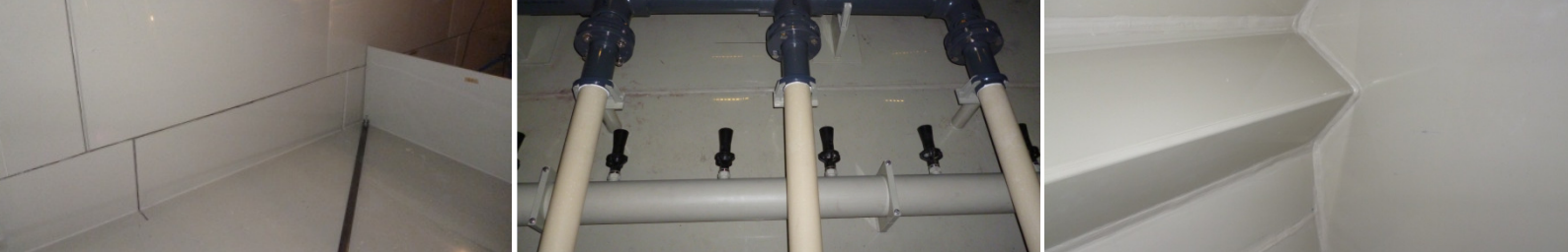
From left to right: Lining with SIMONA® PP AlphaPlus® sheets; nozzle pipes comprising SIMONA® PP AlphaPlus® pipes; safe welded connections with SIMONA® PP AlphaPlus® welding rods.